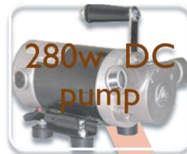
280w DC pump