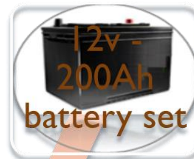
12v - 200Ah battery set