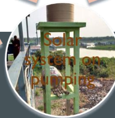
Solar system on pumping

RICH SUN RADIATION MAKES SOLAR ENERGY SYSTEM A CONVENIENT CHOICE IN POWER-PUMPING WATER SUPPLY, STORAGE AND DISTRIBUTION